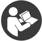
Refer to Instruction Manual

IMPORTANT: PLEASE READ THESE INSTRUCTIONS CAREFULLY. NOTE THE SAFE OPERATIONAL REQUIREMENTS, WARNINGS & CAUTIONS. USE THE PRODUCT CORRECTLY AND WITH CARE FOR THE PURPOSE FOR WHICH IT IS INTENDED. FAILURE TO DO SO MAY CAUSE DAMAGE AND/OR PERSONAL INJURY AND WILL INVALIDATE THE WARRANTY. KEEP THESE INSTRUCTIONS SAFE FOR FUTURE USE.