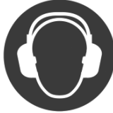
Wear Ear Protection