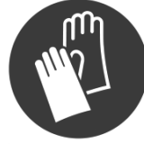
Wear Protective Gloves