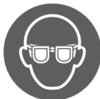
Wear eye protection