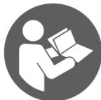
Refer to instructions

IMPORTANT: PLEASE READ THESE INSTRUCTIONS CAREFULLY. NOTE THE SAFE OPERATIONAL REQUIREMENTS, WARNINGS & CAUTIONS. USE THE PRODUCT CORRECTLY AND WITH CARE FOR THE PURPOSE FOR WHICH IT IS INTENDED. FAILURE TO DO SO MAY CAUSE DAMAGE AND/OR PERSONAL INJURY AND WILL INVALIDATE THE WARRANTY. KEEP THESE INSTRUCTIONS SAFE FOR FUTURE USE.