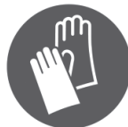
Wear protective gloves